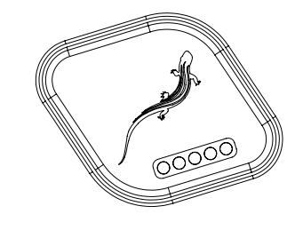
Extra Firm (Sold Separately) 250-330lb (115-150kg) Part Number: AAE0270-80

NOTICE! If you ride in muddy conditions, using either a fender or the Cane Creek Thudglove neoprene boot will protect the pivots and extend the life of your seatpost.