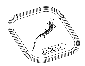
Firm 200-250lb (90-115kg) Part Number: AAE0270-70